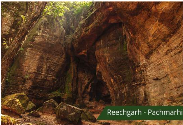
Reechgarh - Pachmarhi