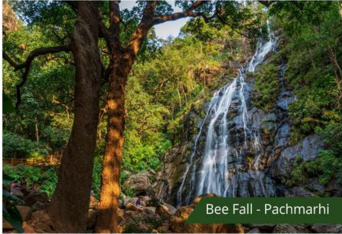
Bee Fall - Pachmarhi

After Breakfast and refreshments get ready to visit Bison Lodge, Jatashankar point, the most popular waterfall, "Bee Fall", a natural stream found 365 days. After Bee Fall visit Reechgarh. A Break for lunch. After refreshments, visit the highest peak of Satpura Ranges "Dhoopgarh" OR Sunset Point. Dinner and Night stay.