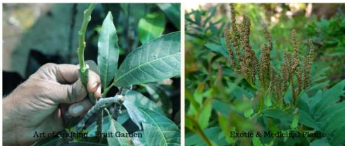
Art of Spicing - Fruit Garden