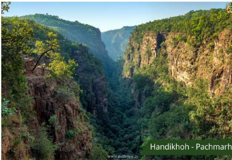
Handikhoh - Pachmarhi

Welcome drink on arrival at the resort. After refreshments and lunch, get ready to explore Pachmarhi. This day visit to Handikhoh, Forsyth Point, Mahadev and Gupt Mahadev. Back to the resort by sunset. Enjoy Dinner at resort. Night stay.