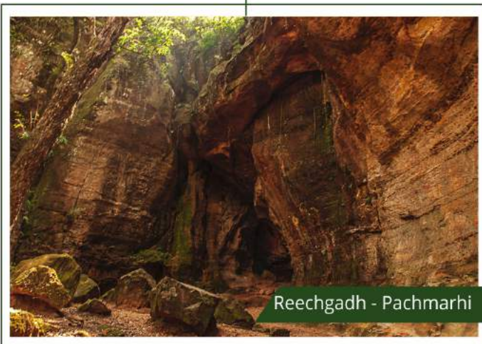
Reechgadh - Pachmarhi