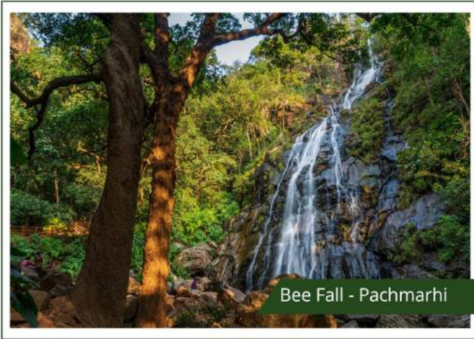
Bee Fall - Pachmarhi

After Breakfast and refreshments get ready to visit Bison Lodge, Jatashankar point, the most popular waterfall, "Bee Fall ", a natural stream found 365 days. After Bee Fall visit Reechgarh. A Break for lunch. After refreshments, visit the highest peak of Satpura Ranges "Dhoopgarh "OR Sunset Point. Dinner and Night stay.