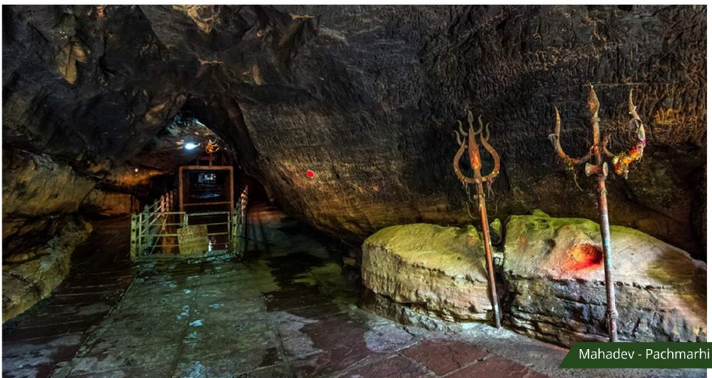
Mahadev - Pachmarhi