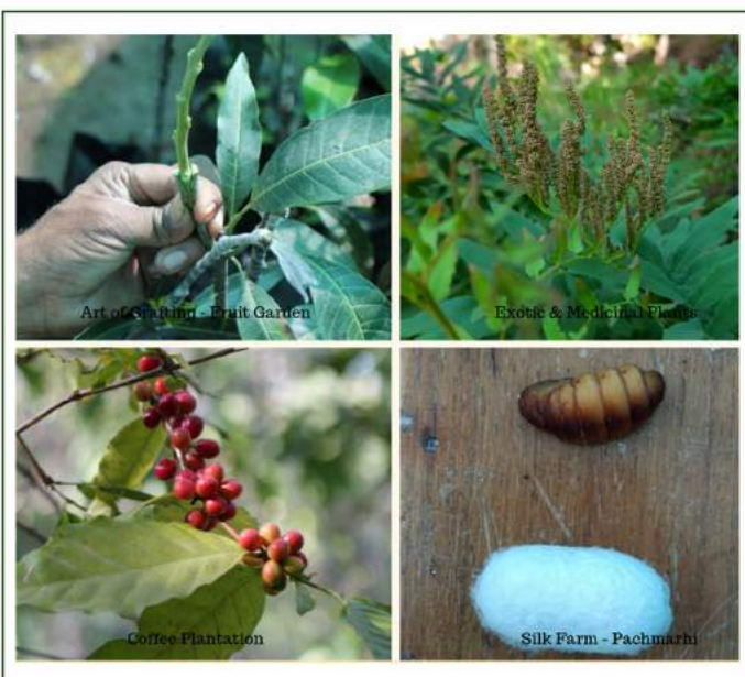
Art of Spicing - Fruit Garden

Sight-seeing Inclusions: Handikhoh, Jatashankar, Forsyth Point, Mahadev, Gupt Mahadev, Bee Fall, Bison lodge, Reechgarh, Dhoopgarh.